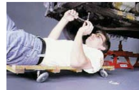
The open end design allows access to the vehicle underbody.